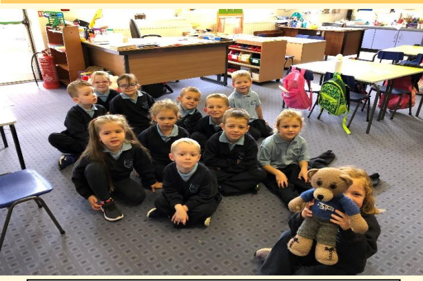
Mullabear Winners - P1/2